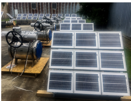
Figure 2: Pipeline control stations employ 12 and 16-inch ball valves automated with electric actuators. Each valve has its own solar panel.

The systems were emulated and positioned so that testing and recording could be executed each day over a 30-day period.