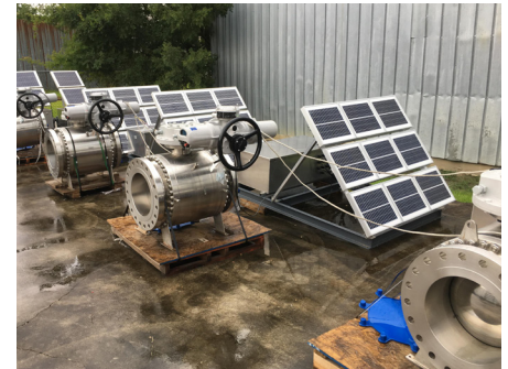
Figure 3: Testing at the Wolseley facility demonstrated the effectiveness of the solar power solution.

Innovative solar power solution provides the proper voltage to operate automated modulating and isolation valves with a tremendous safety factor.