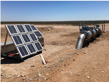
Figure 4: A rigorous evaluation of the solar-powered valve packages validated the expected performance signatures.

By partnering with a trusted automation equipment supplier, oilfield service companies can improve the efficiency and reliability of their water disposal infrastructure while improving safety and reducing costs.