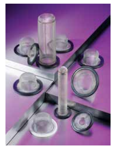
Sock Screen Gaskets For plant intake and bulk tank applications. Speeds unloading and reduces cost.