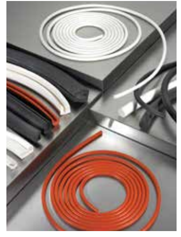
Extrusions and Cord Stock Newman has a wide selection of profiles and cord stock available to purchase by the foot or to an exact size per the customer specifications.