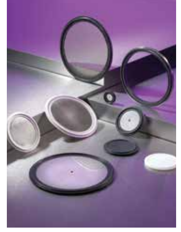
Screen Gaskets & Orifice Plates Made with FDA compliant compounds validated for the Dairy industry with 316 stainless steel wire mesh and 316L stainless steel discs.