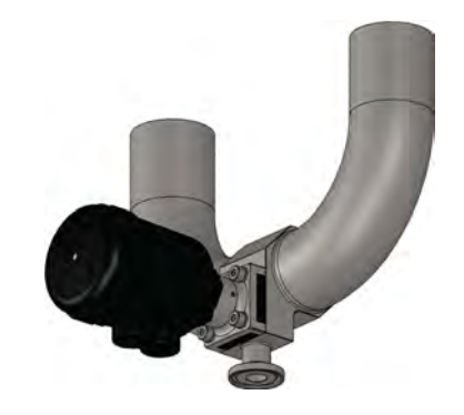
N0818D4 1/2" Valve | N/O Actuator | ZST Mounting Holes

Contact your sales representative for any non-standard bonnet options.